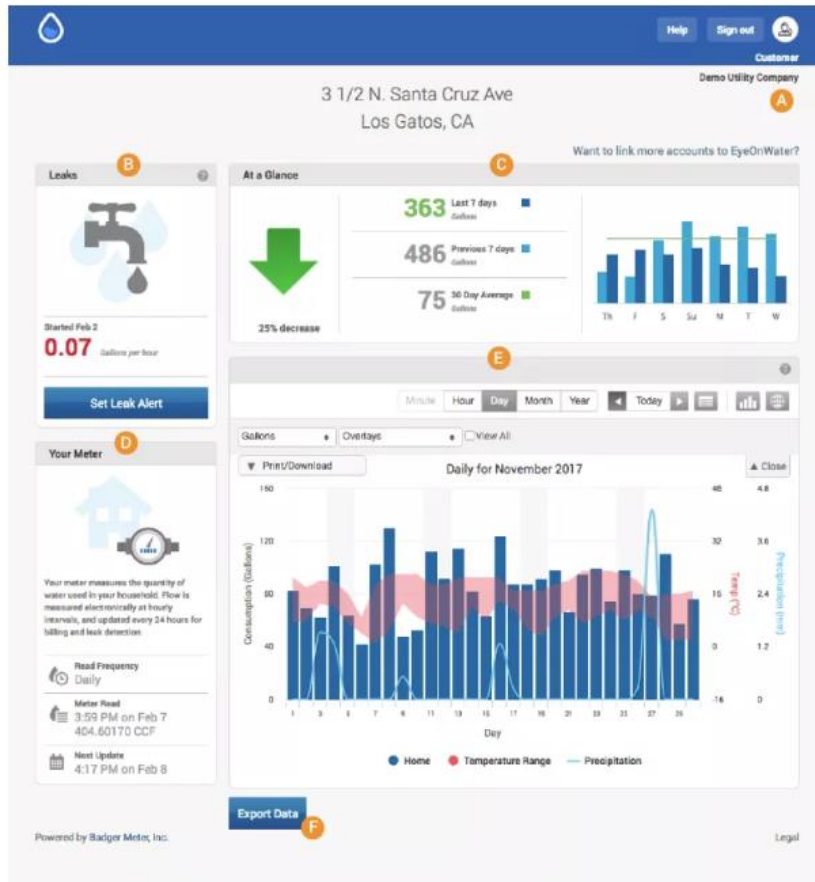
A Welcome | B Leaks | C At a Glance | D Your Meter | E Consumption Graph | F Export Data