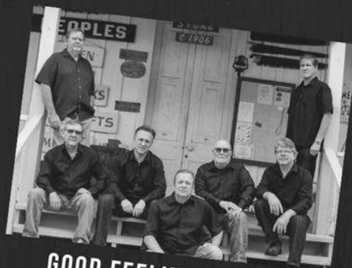
GOOD FEELIN' 6:30 PM