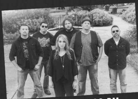
VELVET SKY 2:00 PM