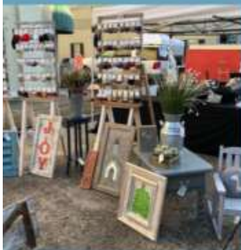
Arts &amp; Crafts