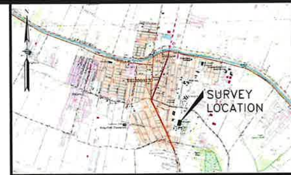
VICINITY MAP 1"=3,000'

A "SURVEY PLAT SHOWING THE OFFICAL PARTITIONING OF EXISTING LOTS SITUATED ALONG SOUTH ACADIA DRIVE, LEDET STREET, AND IRIS STREET AS SUBDIVIDED FROM A TRACT OF LAND OWNED BY ANTHONY CHARLES LEDET WINSTON P. LEDET AND LINDA LEDET LEVERT AND LOCATED IN SECTION 163, T-15-S, R-16-E IN THE CITY OF THIBODAUX, PARISH OF LAFOURCHE, STATE OF LOUISIANA" PREPARED BY: TERRY J. DANTIN, P.L.S. DATED: DECEMBER 1, 1992