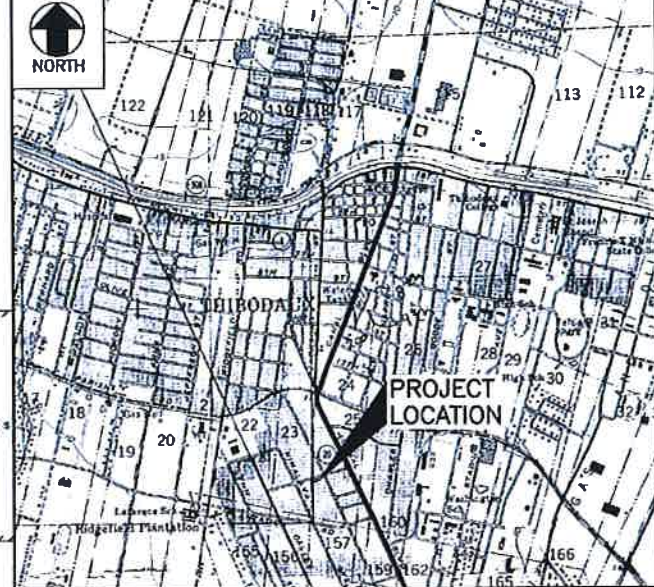
VICINITY MAP SCALE 1" = 2000'

PORTION OF LOT 9 & 10, BLOCK 7 DAVID J. STAGNI 207 LAFAYE AVE. THIBODAUX, LA (NOT A PART)