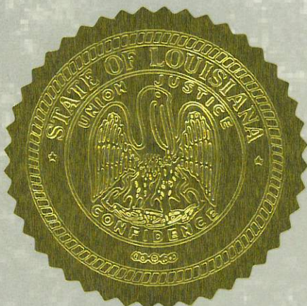
John Bel Edwards Governor

IN WITNESS WHEREOF, I have hereunto set my hand officially and caused to be affixed the Great Seal of the State of Louisiana, at the Capitol, in the City of Baton Rouge, on this 10th day of April A. D., 2023 .